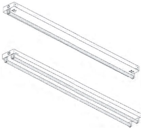
Channel Strip Fixture 1-Lamp and 2-Lamp configurations

Applications: Warehouse, retail stores, factories and other industrial spaces.