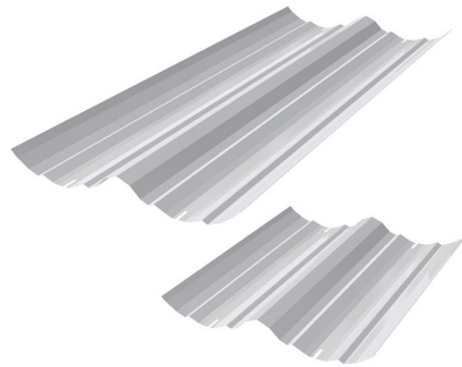
2-Lamp Troffer Reflector

Applications: Offices, Schools, Hospitals, Restaurants, Retail and other spaces.