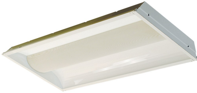
Available in 1, 2, or 3-Lamp Design (T5HO only) Recessed Direct / Indirect T5 Fixture shown

Applications: Retail, Offices, Schools and Hospitals; i.e., Standard 15/16" grid ceilings